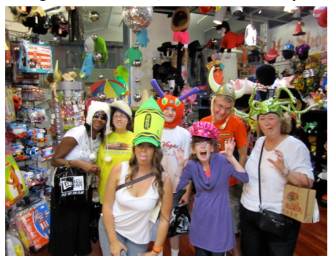
Having fun in some shops on the walk back to the hotel.

Friday morning started with breakfast at the famous Pike's Place Market, where we witnessed merchants tossing the fish in the air, and viewed the many wonderful flowers, produce, and crafts that Seattle has to offer.