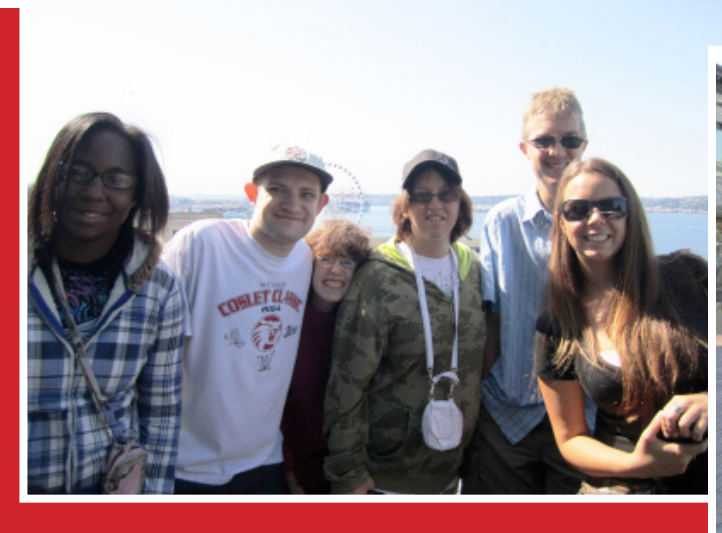
Sight seeing around Seattle.