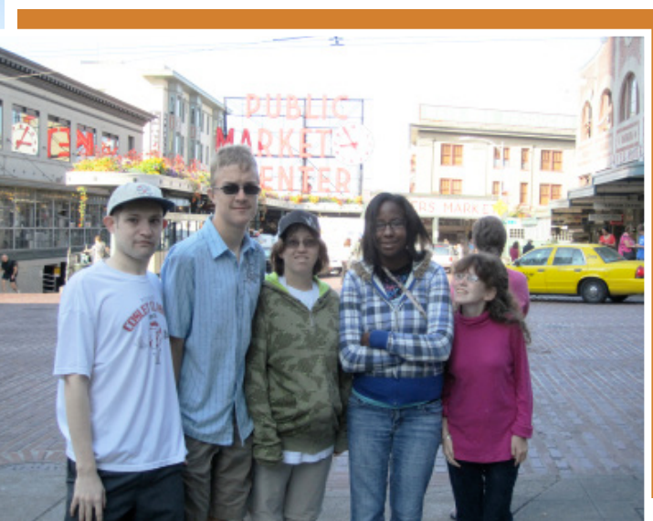
Enjoying Pike's Market Place.