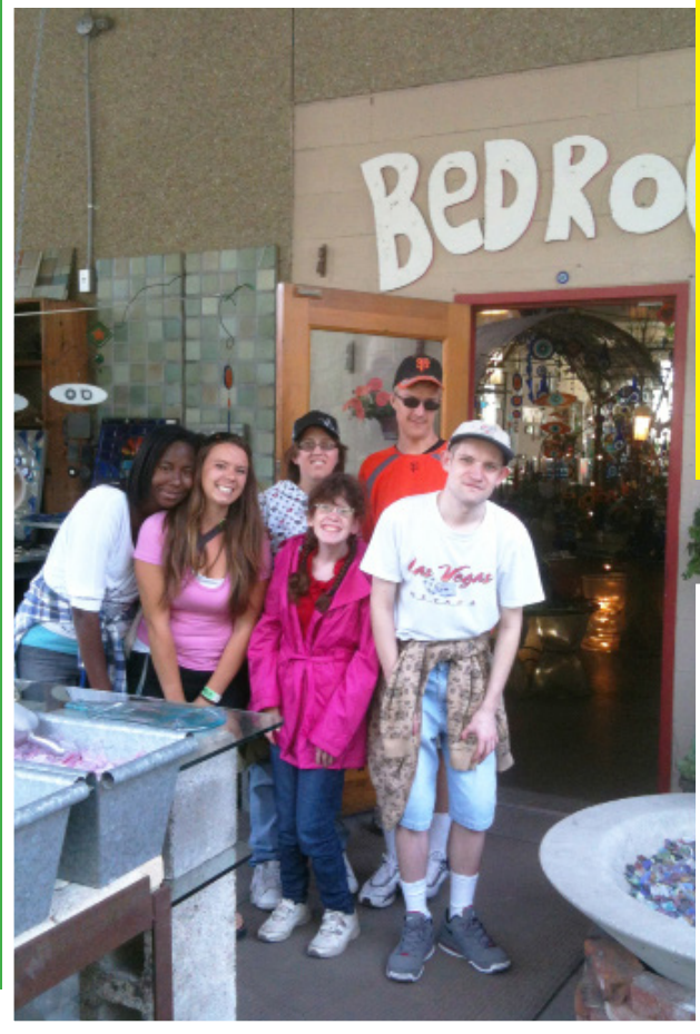
Our group at the Bed Rock Company. We feature their beautiful products in our Gift Shop!